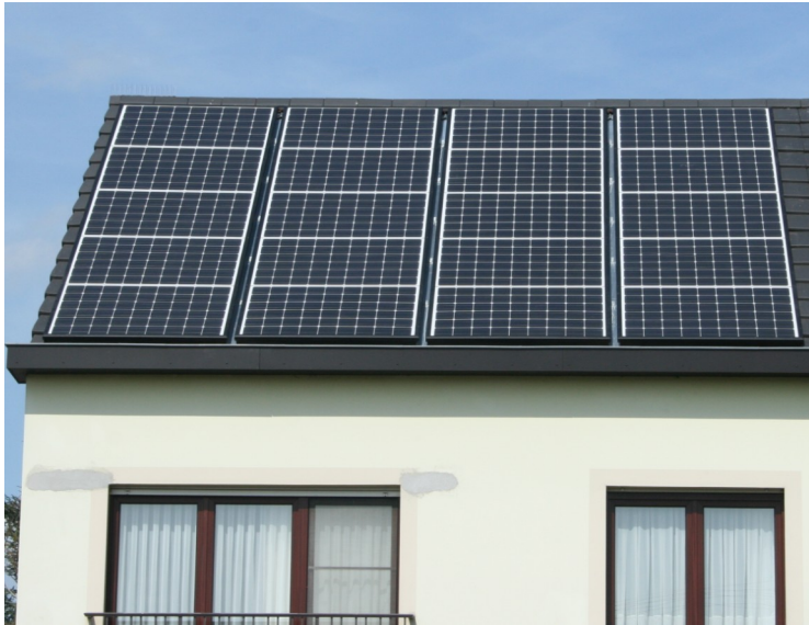
Photovoltaic solar installations ROOF-INTEGRATED PV SYSTEM

The ZEN® Powervolt is the optimal solution for roof integrating a PV system. A high quality aluminium frame contains up to 5 PV-laminates. The system can be tailor-made to the wishes of the customer and to the constraints of the useful roof-space. Every laminate is made from highly efficient mono crystalline PV cells (6" wafer). Electrically, the ZEN® PowerVolt fits completely the Fronius IG en IG plus invertors. This combination is mostly used in a grid-connected system.